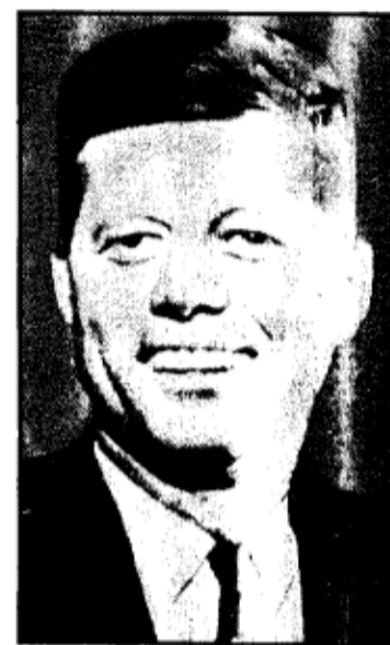
DANGEROUS LIAISON... Sam Giancana and John Kennedy

because of my uncle. The name Giancana, which for years was seldom off the front pages, was a dirty word in Chicago.