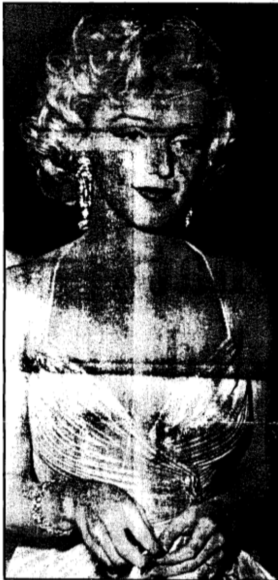
REVELATIONS... of Marilyn Monroe's death

Then one June night in 1975, in the basement of his Chicago house, Sam Giancana died as he had