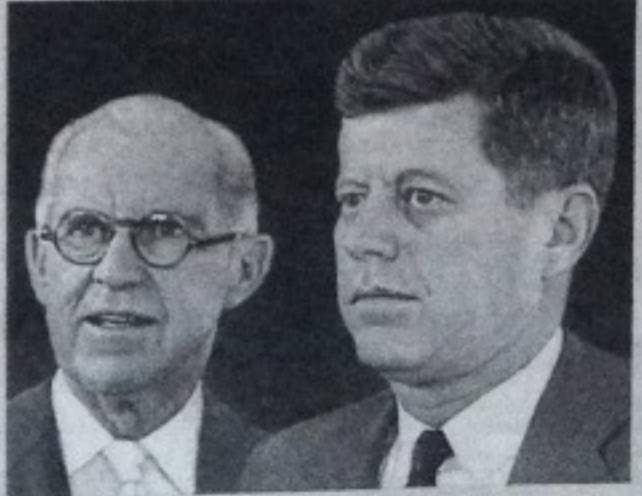
SELL-OUT: Joe Kennedy told the mob he'd make JFK their puppet if they helped rig the election.