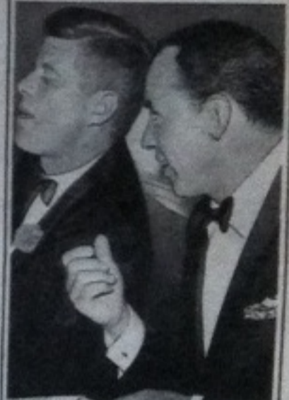
SINATRA was pals with Jack and Bobby Kennedy — and Giancana used the crooner to find women for JFK.

Overnight, Sam's dream of having a president he could control had become a reality. America's top mob boss had never been so happy.