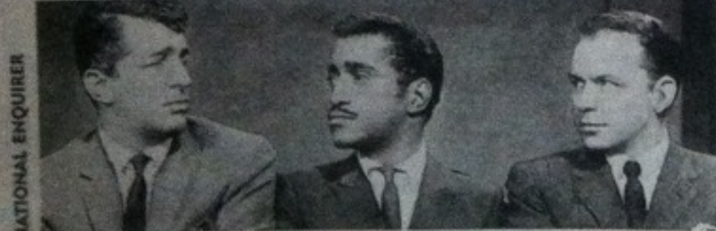
RAT PACK PALS: Dean Martin, Sammy Davis, Jr. and Frank Sinatra partied with mobster Giancana.