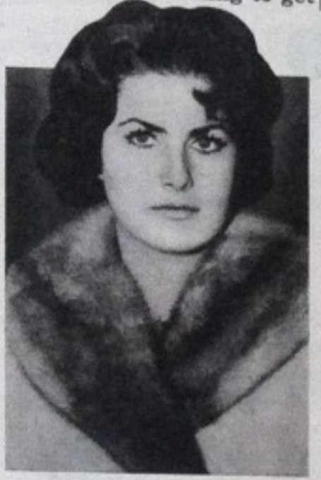
JFK'S GIRLFRIEND Judith Campbell. Giancana wanted to use her to manipulate Kennedy.

cure in the knowledge that the dirt he was collecting would keep the Kennedys in line, Sam instructed Sinatra to start working to get