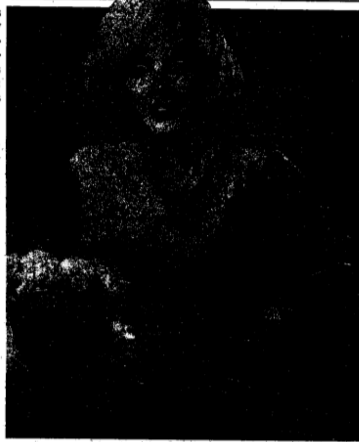
MARILYN MONROE: Murdered by the mob — because she knew too much and was about to spill the beans.