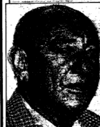
HARRY COHN: The studio boss had business ties to the mob — and also slept with Marilyn.