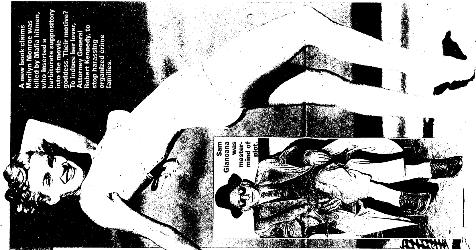
Sam Giancana was master-mind of plot.

A new book claims Marilyn Monroe was killed by Mafia hitmen, who inserted a barbiturate suppository into the movie goddess. Their motive? To induce her lover, Attorney General Robert Kennedy, to stop harassing organized crime families.