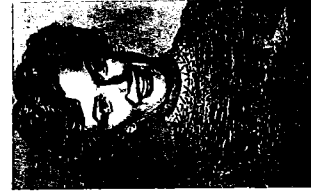
Marilyn: Secret child claim.

The vaccine, which would be given by injection or pill, is now being tested on baboons, with funding by Ortho Pharmaceuticals Corporation. Human trials are due to begin in two years.